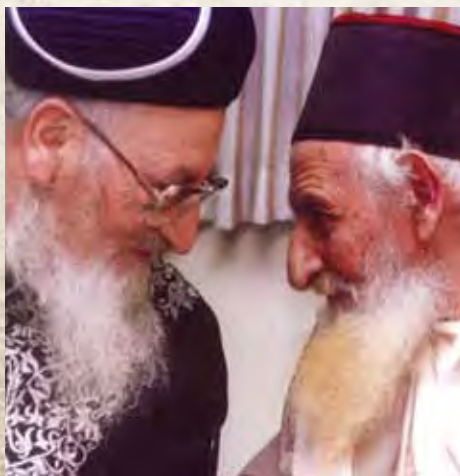
With Hacham Yizhak Kadouri 21