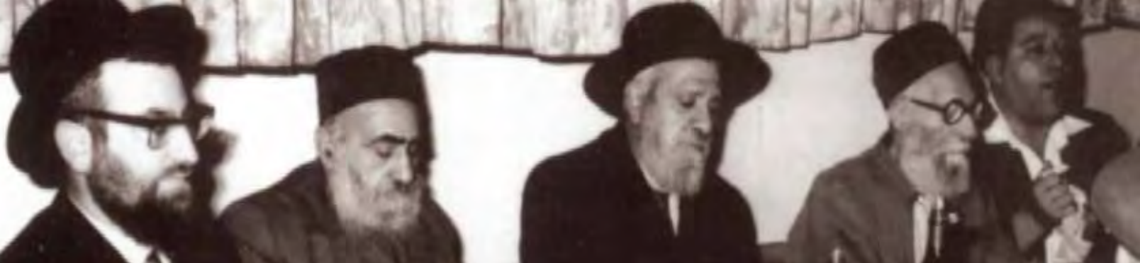
From left to right, Hacham Mordechai Eliyahu TM , Hacham Yaakov Mussaffi TM , Hacham Salman Hougi Aboudi TM , Hacham Yehoshua Sharabani TM , Hacham Moshe Sharabani shelita

more if the rabbi would agree to continue his studies in New York. In spite of his background of dire poverty and having been orphaned from his father at a young age, the young scholar could not be swayed by the kind material offer. Finally, seeing how strong his desire was to continue growing in Torah, the Rosh Yeshiva accepted the young scholar's decision to decline the position.