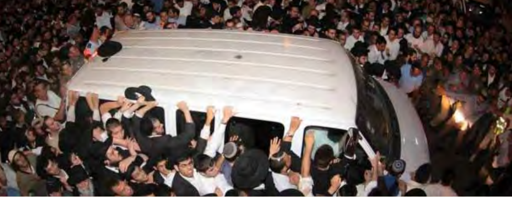
Hacham Mordechai's funeral was attended by over 100,000 people..