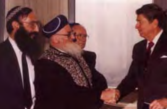
At a meeting with US President Ronald Reagan